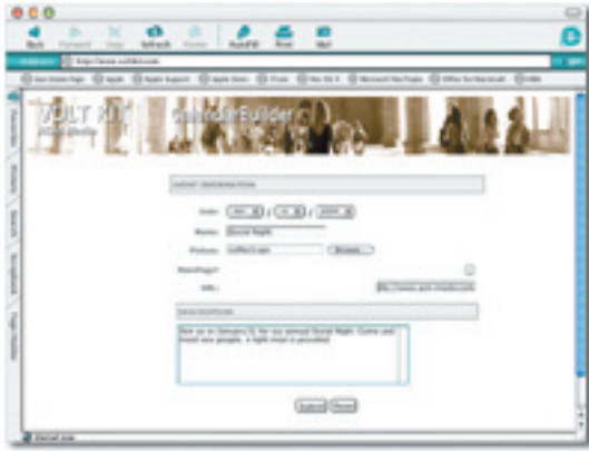
Add a new event to the online calendar